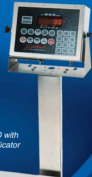
EB-300 with 210 Indicator