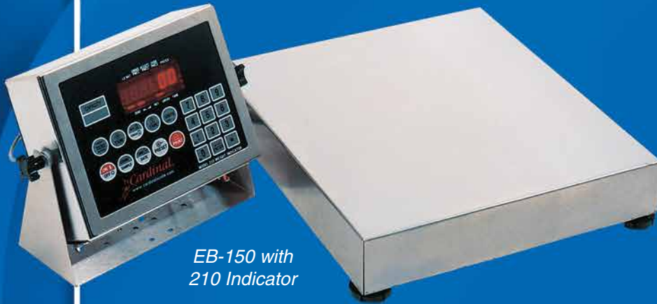
EB-150 with 210 Indicator

Designed for top performance and long-term accuracy.