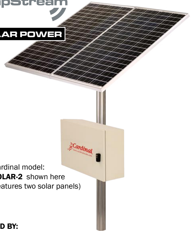
Cardinal model: SOLAR-2 shown here (features two solar panels)