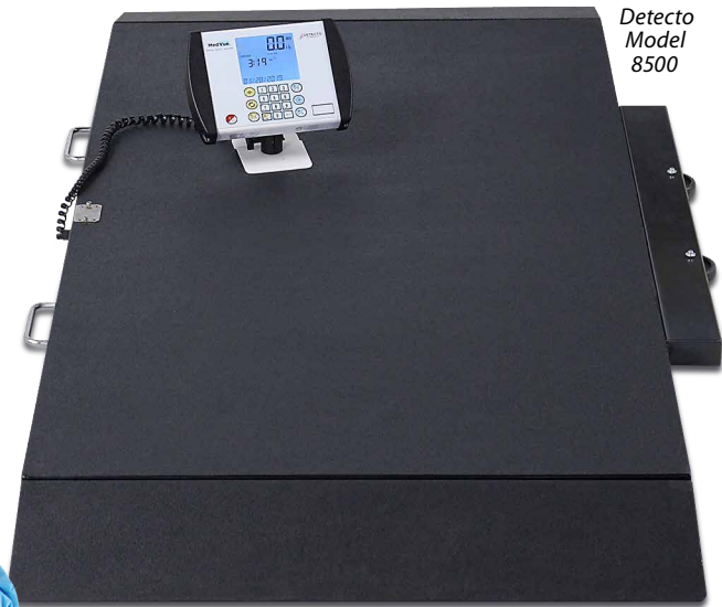
Detecto Model 8500