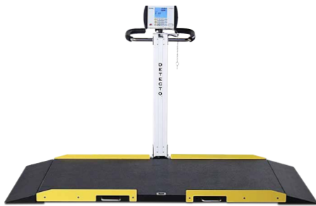
DETECTO model 8550 shown with optional yellow guide rails