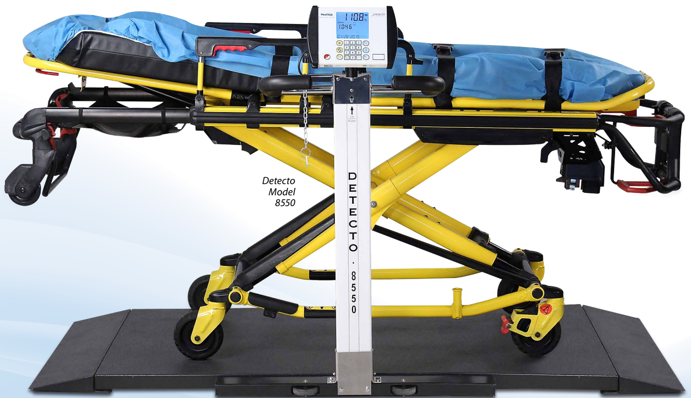
Detecto Model 8550