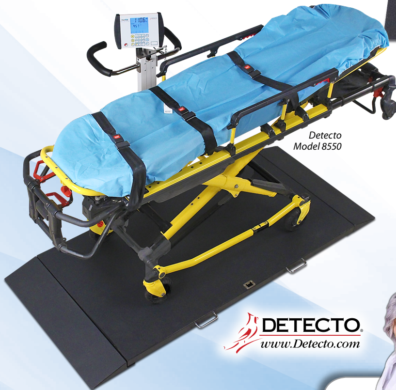
Detecto Model 8550